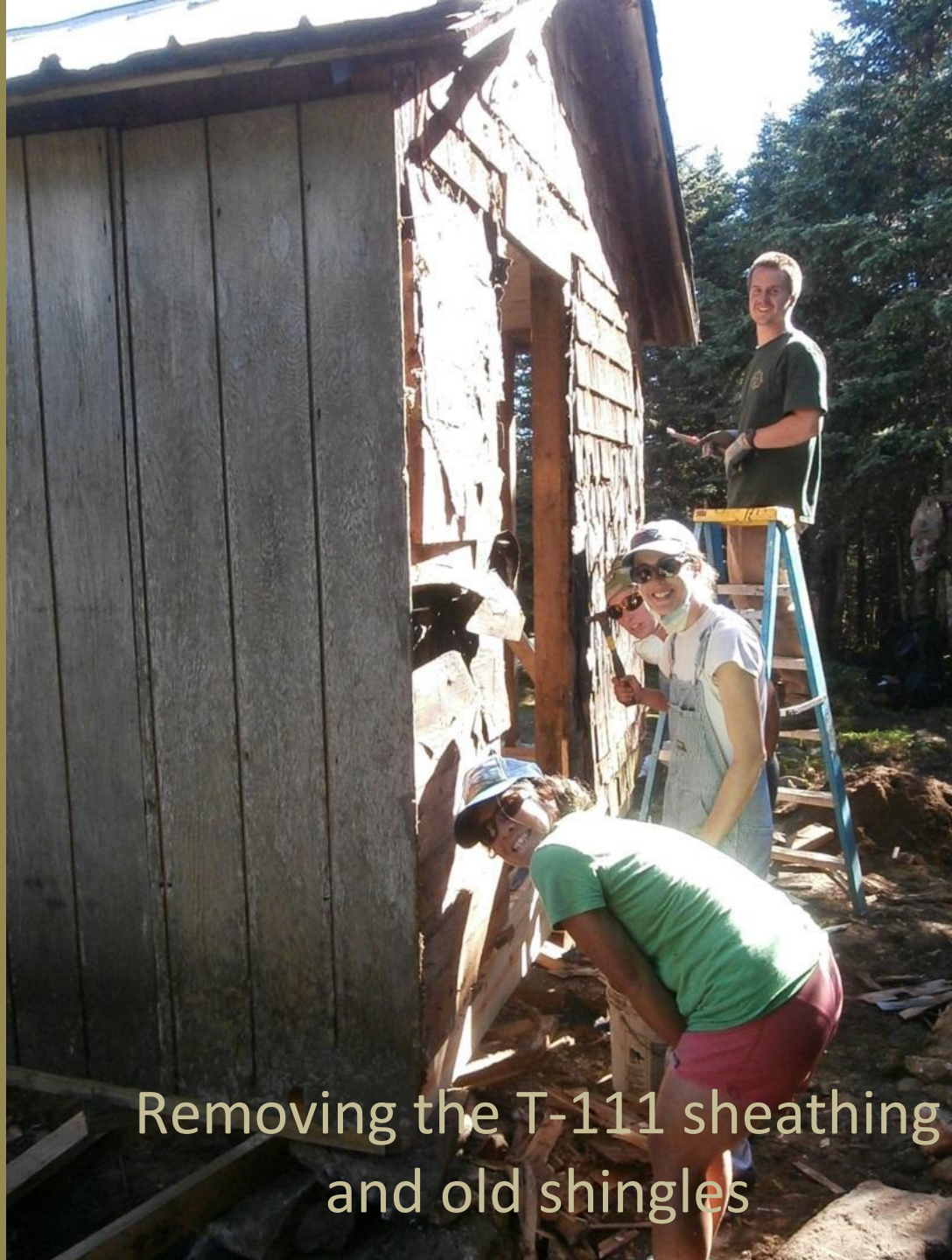
Removing the T-11 sheathing and old shingles