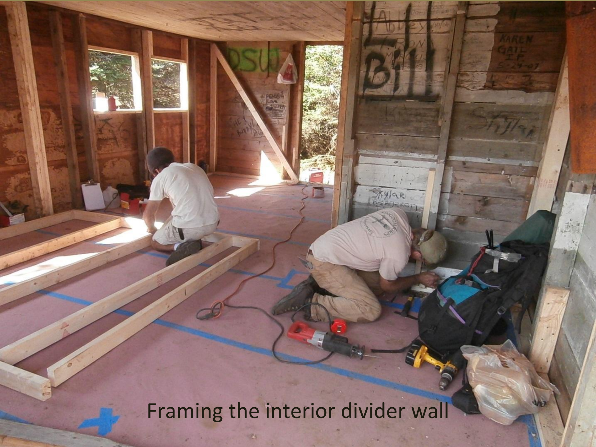
Framing the interior divider wall