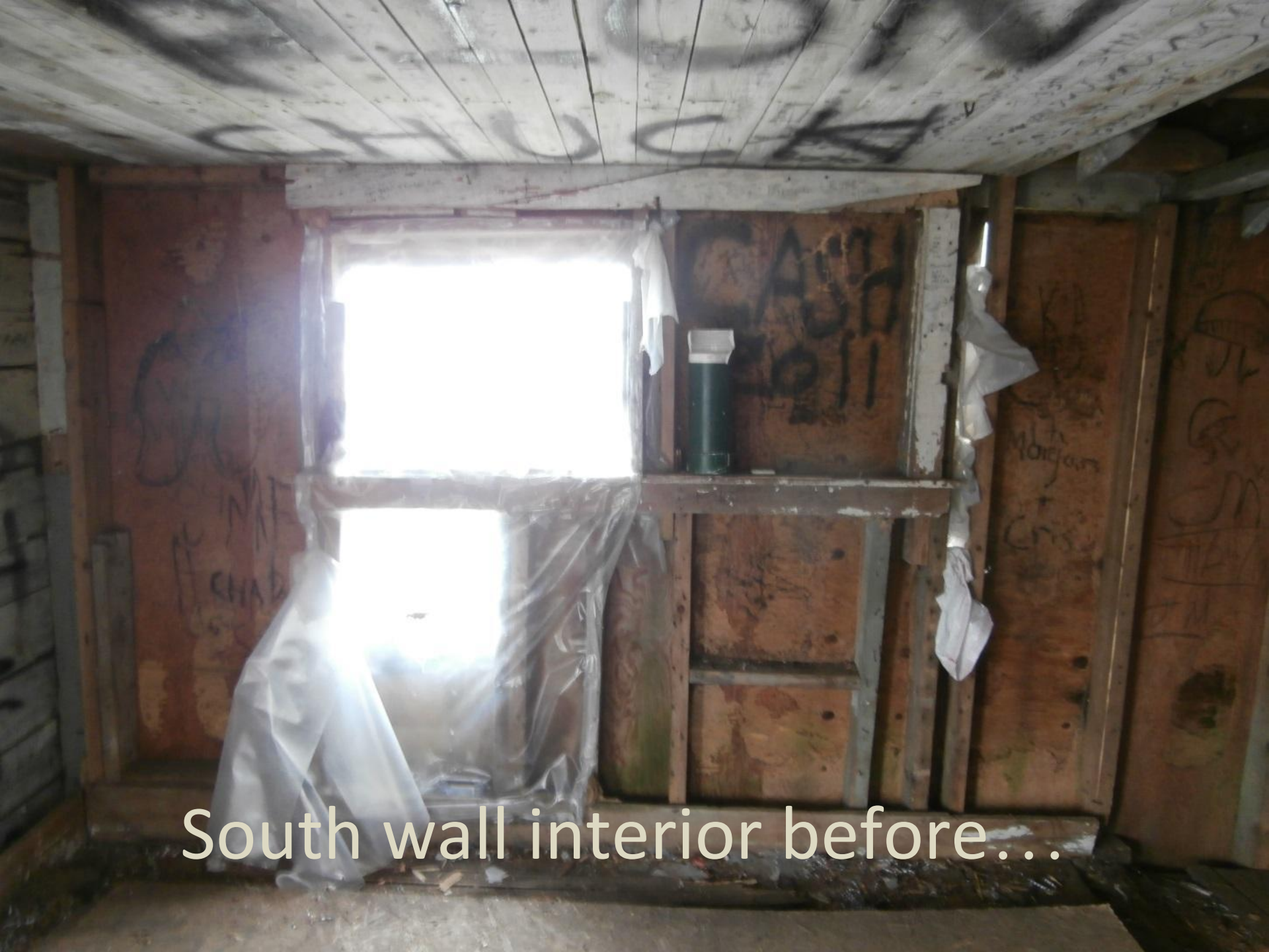
South wall interior before...