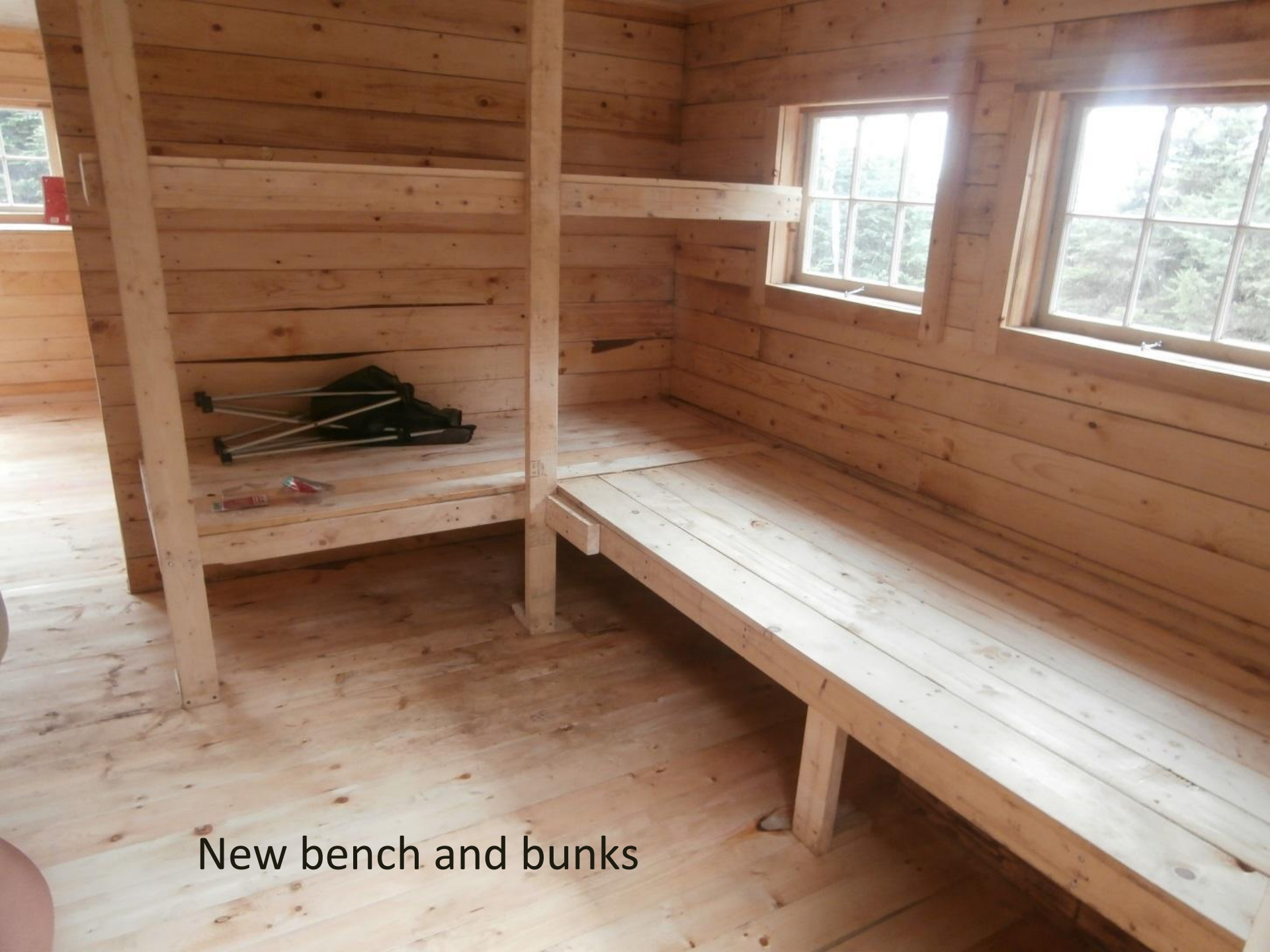
New bench and bunks