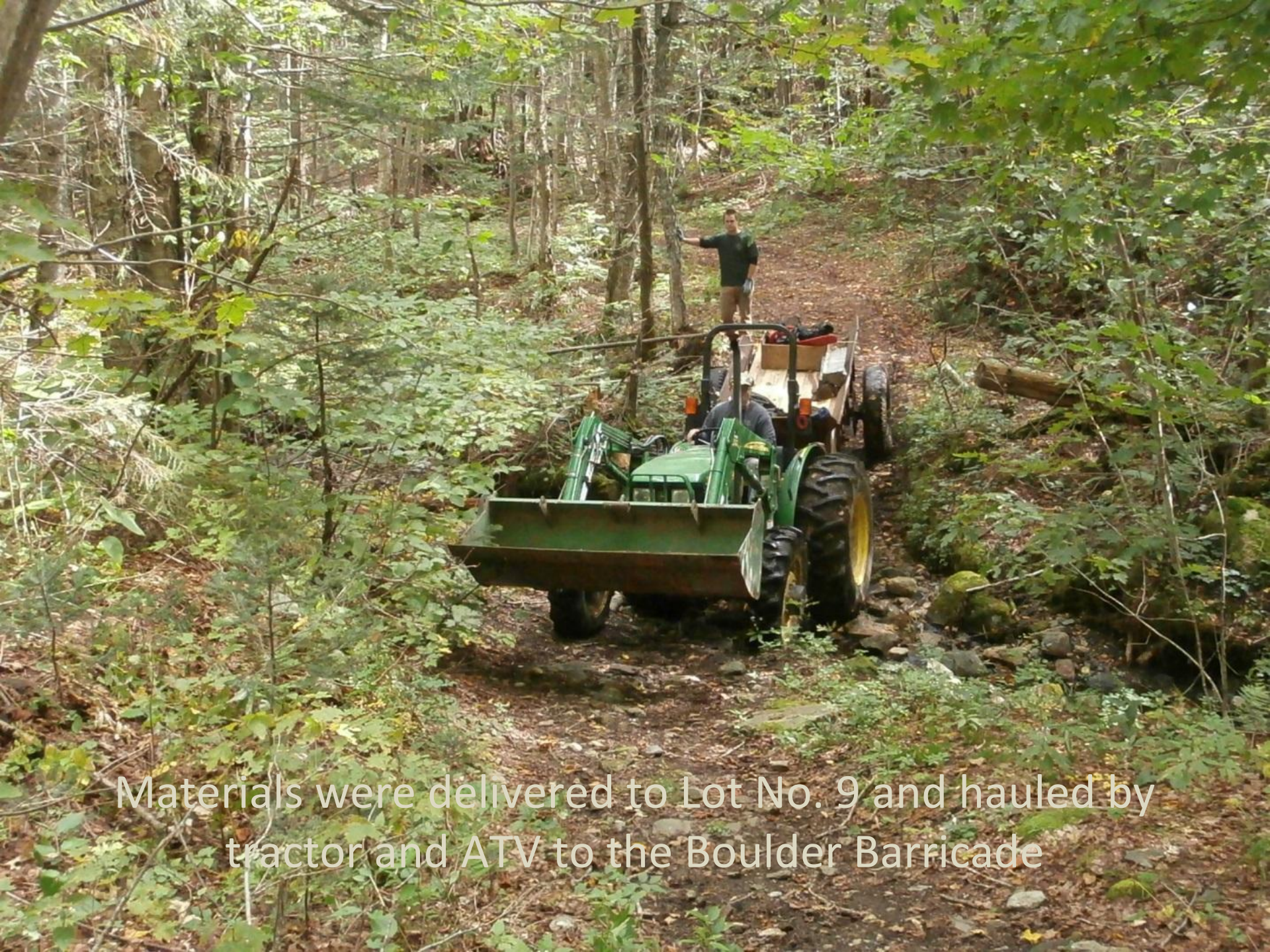
Materials were delivered to Lot No. 9 and hauled by tractor and ATV to the Boulder Barricade