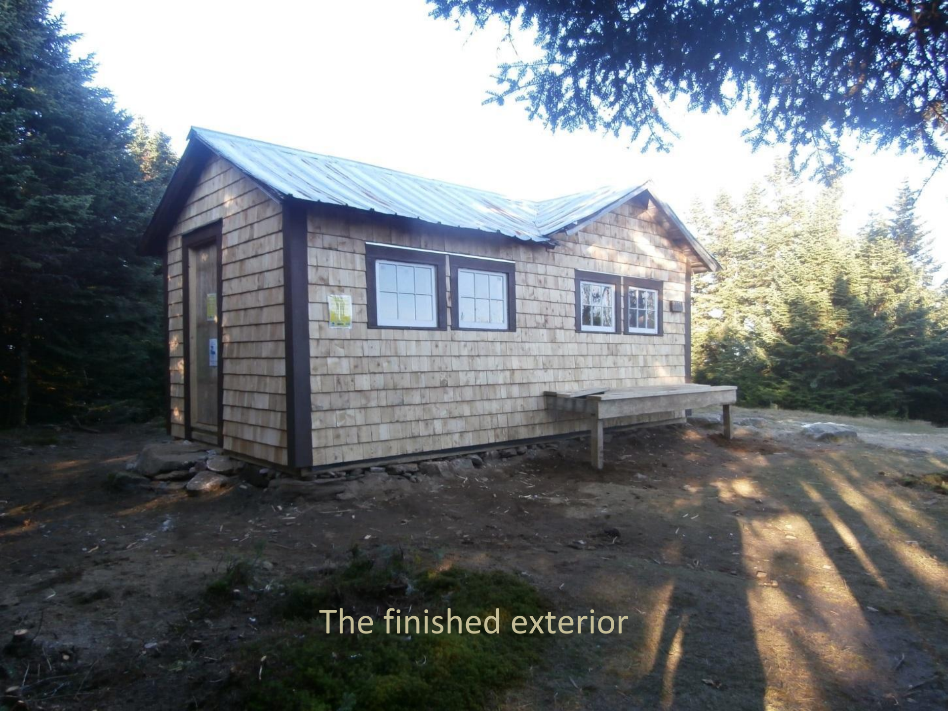
The finished exterior