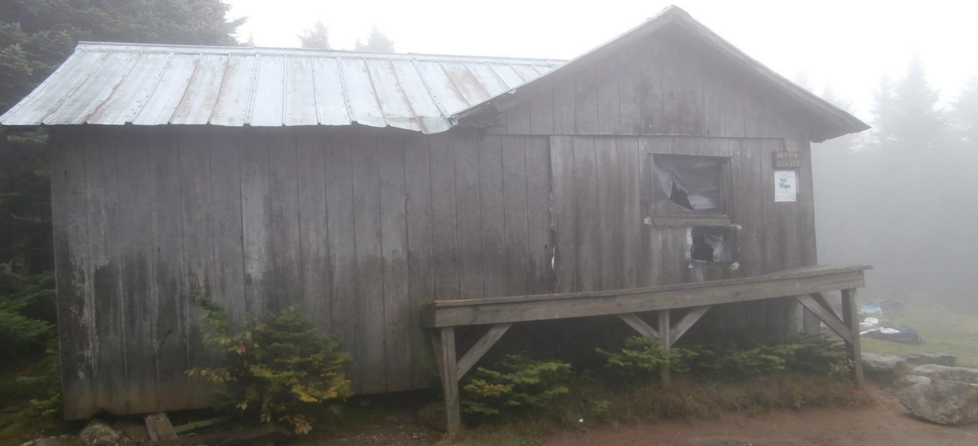
Bald Mountain Cabin, constructed c. 1922