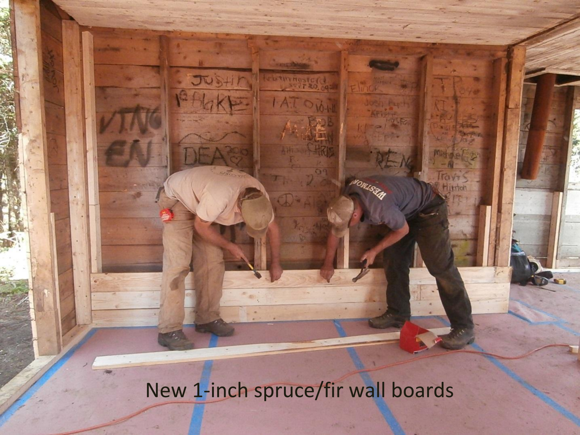
New 1-inch spruce/fir wall boards